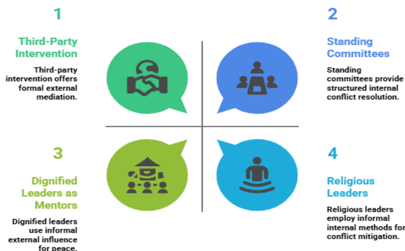
Figure 2. Conflict Resolution Mechanisms in Benue State

There are several mechanisms proposed for solving or managing security challenges or conflict in Benue state. These range from third party intervention; use of standing committees or ad-hoc groups within the country or region; use of dignified leaders, head of states within the region who are mentors and are perceived wise with dept of understanding (Koffi, 2010). In emphasizing on the importance of African solutions from within Africa, Kasomo (2010) reveals that religion can also be used to arrest or mitigate conflicts in Africa.