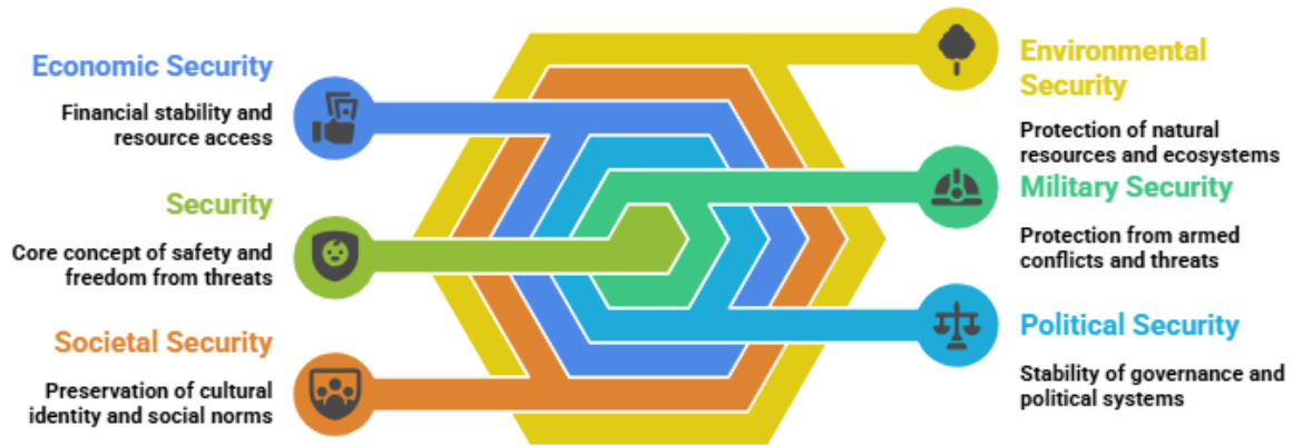
Figure 1. Security components

sectors. According to the works of Buzan, Ole, and Wilde (1998), five major sectorial securities were identified including Military, Political, Economic, Societal and Environmental.