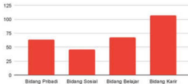
Figure 3. Table of Assessment Results for Class XII RPL 1 SMK Negeri 1 Cilegon

Based on the bar diagram above, it shows that the problems faced by the majority of class XII RPL 1 SMK Negeri 1 Cilegon students are in the career field. This is proven from the problem items of students in this class who experienced problems in the career field, amounting to 107 people, in second place, namely the learning field, numbering 68 people, 64 people in the personal field and lastly, namely the social field, numbering 46 people.