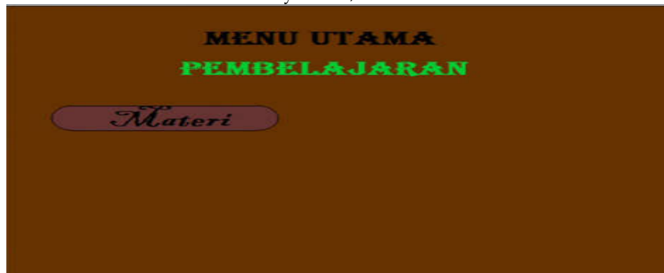
Figure 1 Main Application Display

The main application form is a form that contains buttons that contain sub-menus to run video tutorials, the application is designed to be as attractive as possible as the interface design so that it looks attractive and easy to use, here is the interface.