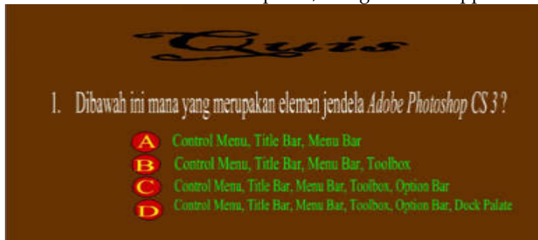
Figure 6 Quiz Display

For questions can be seen in the image below, where the material that is entered will contain questions related to Adobe Photoshop CS3, along with the appearance.