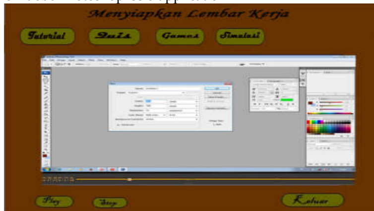
Figure 4 Material Display 2

The 2nd meeting form which contains a video tutorial that explains how to make a worksheet in the Adobe Photoshop CS 3 application