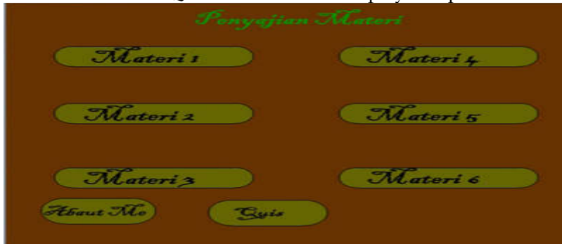
Figure 2 Display For Material Selection

The material selection form has several sub-menus that will be selected for the material to be discussed and the Quis sub menu will display the questions to be answered.