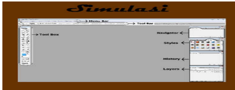
Figure 8 Simulation Display