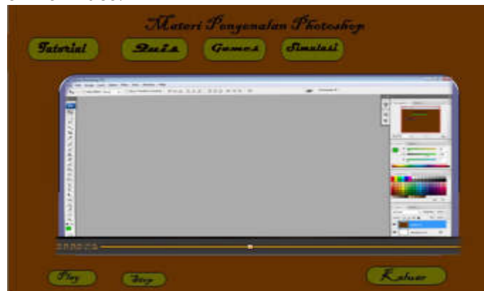
Figure 3: First Material Display

The main form for meeting 1 contains information about the introduction of Adobe Photoshop in the form of video.