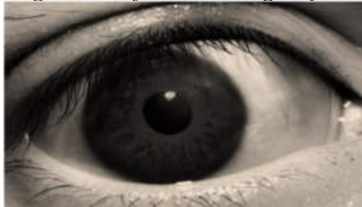
Figure 4. Example of pixel result after a reduction

Pixel results after reducing the red-eye effect on digital photos