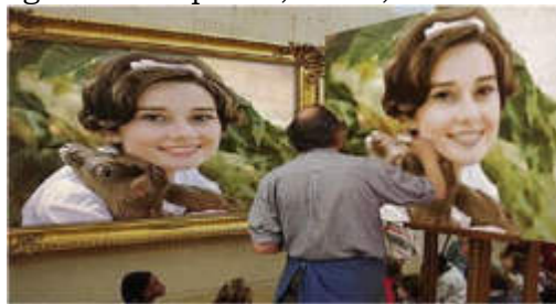
Figure 1. Image processing application

Image processing also allows a person's face to be dartered, for example, shown illustrated 1 Application like this allows the creation of cartoons based on real objects that include image processing facilities that allow each original image to be transformed into an image such as pencil, chalk, as shown in the image below this: