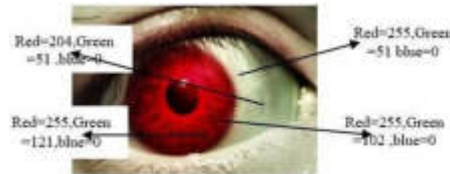
Figure 2 Postion of red eye in a digital photo

For the above algorithm to be more easily understood, the following research includes an example calculation using the above algorithm by only including an example of the input image of the red-eye effect on a digital photo seen in the image below: 1. Input the red-eye image on a digital photo